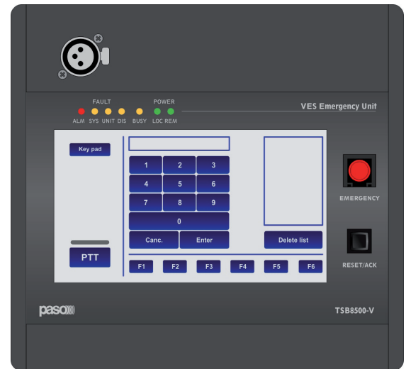
"Numeric pad" mode